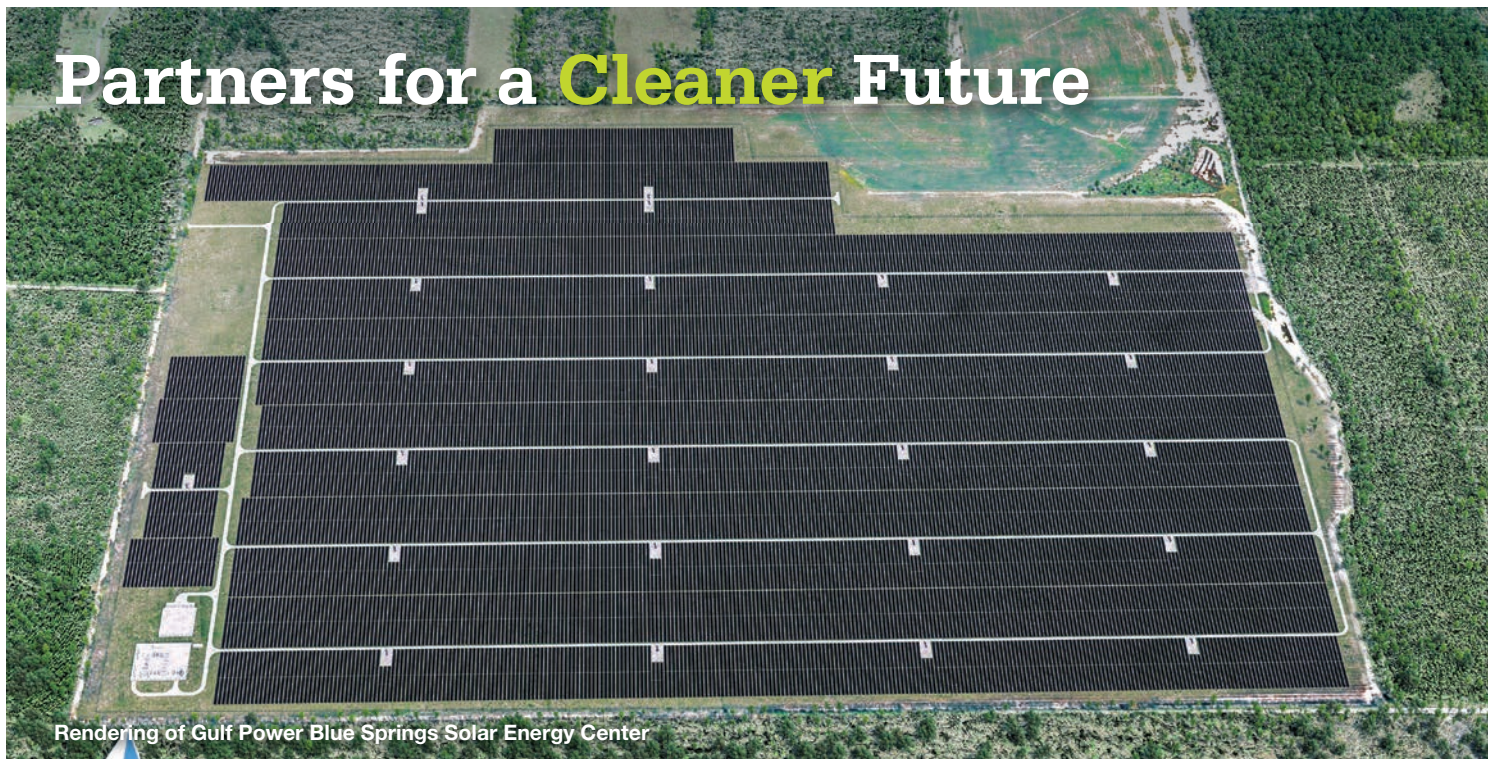
Rendering of Gulf Power Blue Springs Solar Energy Center

Gulf Power is continuously looking for new opportunities to provide clean energy to our customers. Projects like the Gulf Power Blue Springs Solar Energy Center can help meet the energy needs of our customers while reducing carbon emissions and lowering costs. Adding 74.5 megawatts of solar would provide clean, safe and cost-effective energy to our customers in Northwest Florida. We're excited about developing a second solar energy center in Jackson County!